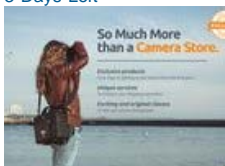
Henry's Valid until Dec 24 See all your local flyers