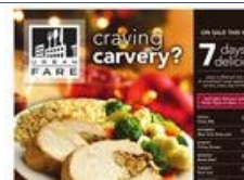
Urban Fare Expires this Thursday