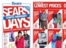
Sears 3 Days Left